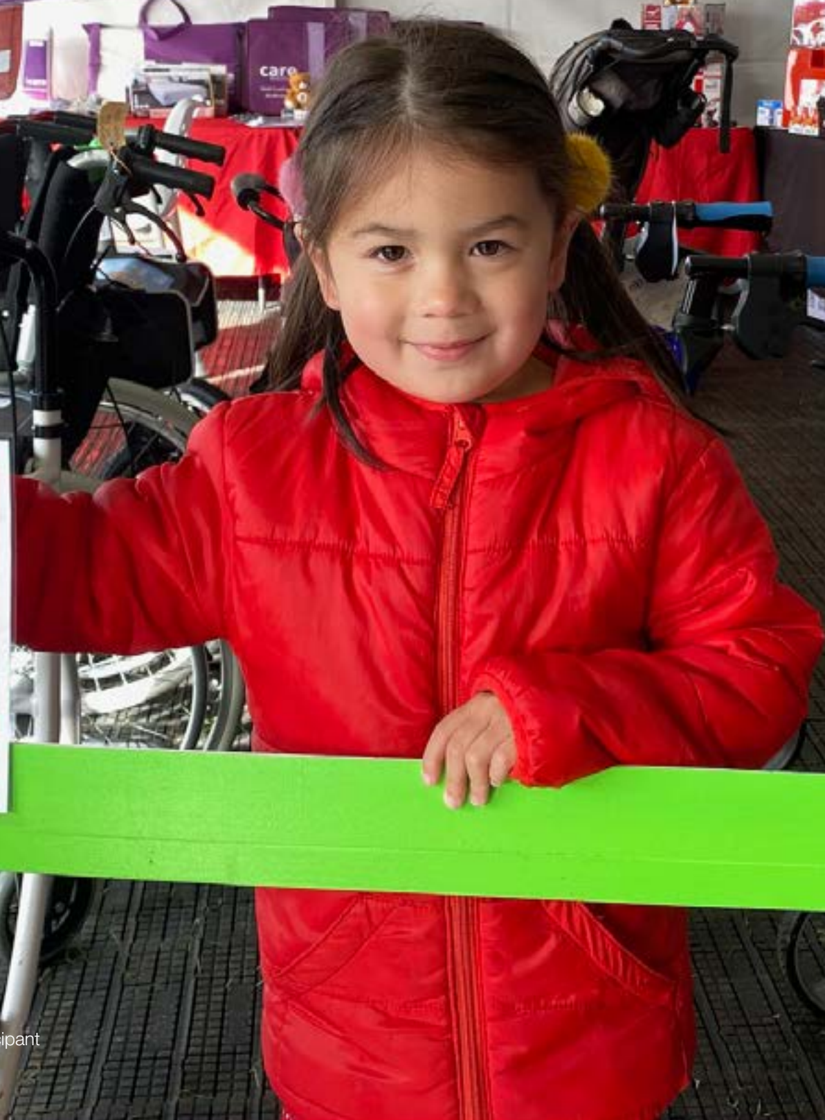
Young Agfest participant